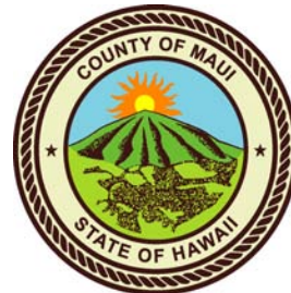
Office of the Mayor County of Maui