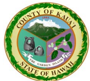
Office of the Mayor County of Kaua'i