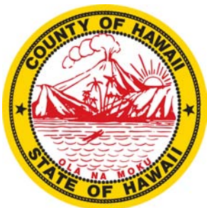
Office of the Mayor County of Hawai'i